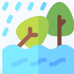
Floods & Dam Failure