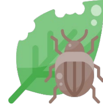
Pest management/Disease outbreak