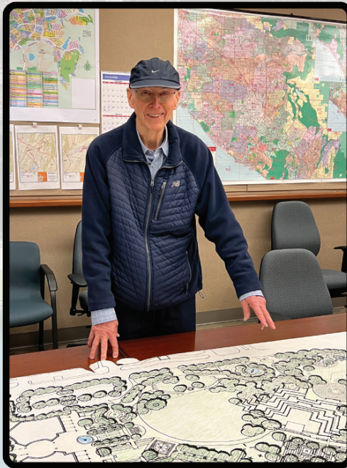
City of Rancho Santa Margarita Master Planner