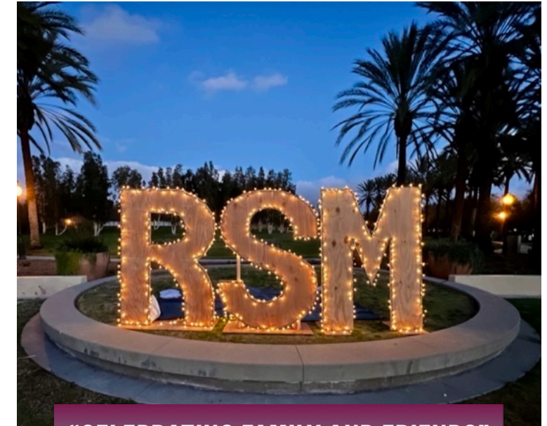
"CELEBRATING FAMILY AND FRIENDS" NEW YEAR'S EVE